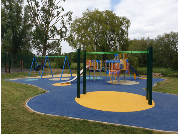
Chicheley Street play area now a NEAP