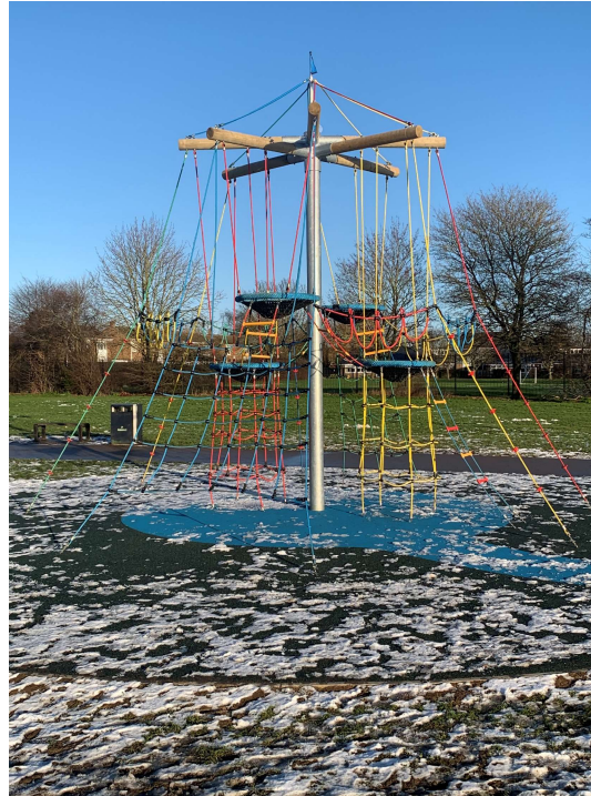
New Buckaneer tower as part of refurb of Riverside Meadow play area