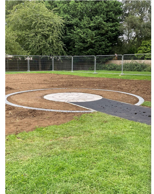
Construction of new remembrance garden at Milton Drive play area