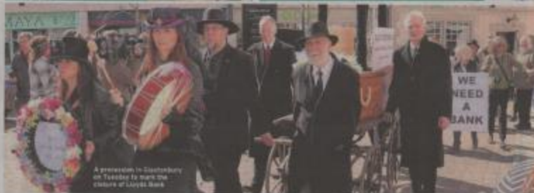
A procession in Glastonbury on Tuesday to mark the closure of Lundy Bank